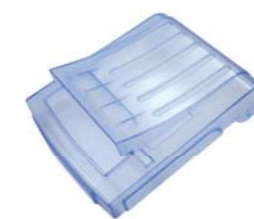
Spill proof cover